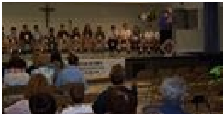
Competitors On Stage