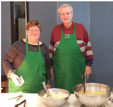
Webers Serve French Fries