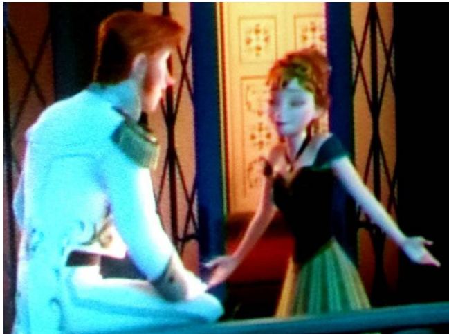
Frozen Plays for the Kids