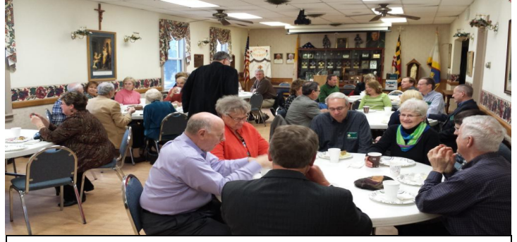
Fraternity and Breakfast