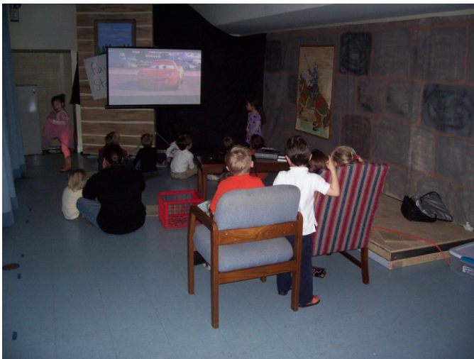
The children had their own entertainment.