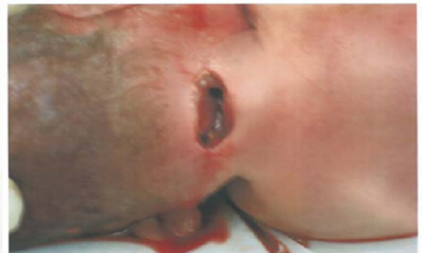
"Baby Boy B," with slit neck

As a nation, we should reflect on the words of Thomas Jefferson, "I tremble for my country when I reflect that God is just: that his justice cannot sleep forever." Pray for an end of abortion. Pray for our country. Pray for your family.